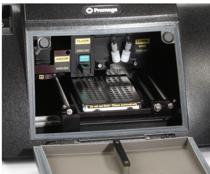
Figure 2. Inside the GloMax®-Multi Detection Instrument.

A typical luminometer consists of a light-sensitive photomultiplier tube (PMT) within a light-proof exterior. The PMT is situated close to the light-emitting sample for maximum sensitivity and collects signal over the entire spectrum of light. Multifunction readers that can read absorbance, fluorescence and luminescence are flexible instruments, but these instruments are not usually optimally designed for reading luminescence. Often sensitivity and dynamic range are compromised because the instruments use long path lengths for filter wheels, fiber optical cables and other assemblies. As a result, extremely bright or dim samples cannot be read appropriately by these instruments, and the data are compromised. The design of the GloMax®-Multi Detection System allows uncompromised performance in luminescence detection that equals that of high-quality, standalone luminometers.