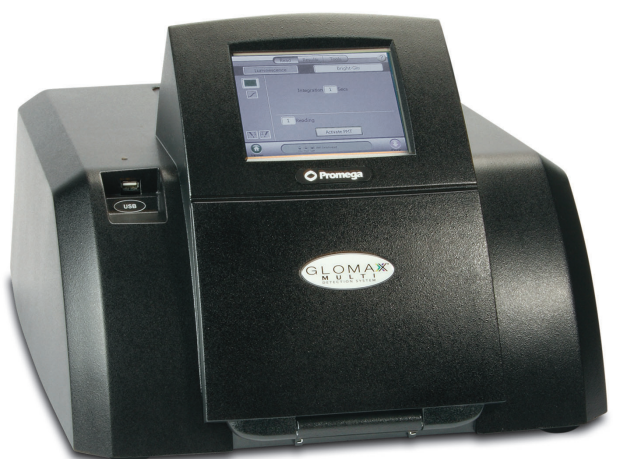
Figure 1. The GloMax®-Multi Detection System.

The GloMax®-Multi Detection System has fully independent luminescence, fluorescence and absorbance detection modules allowing different light paths and detectors optimized for the best performance of each module.