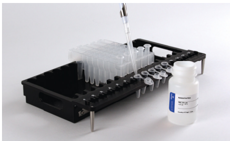
Figure 2. Setup and configuration of the deck tray. Elution Buffer is added to the elution tubes as shown. Plungers are in well #8 of the cartridge.